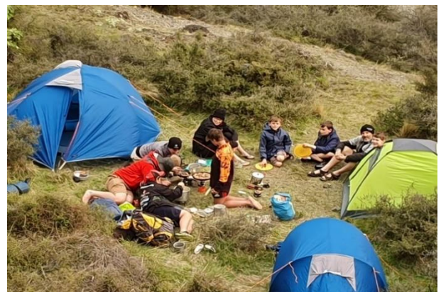
Lincoln ICONZ Lake Tenneson Expedition Bronze Journey

For young men up to the age of 25 who have served as volunteer leaders in BB Company Section or an ICONZ Delta Unit for at least 4 years. Scholarships are for $1000.