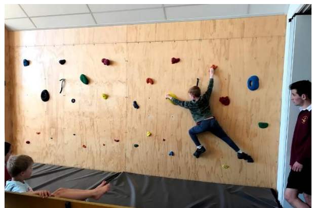
14 th ChCh Coy Climbing Wall/Boulder Mats Equipment